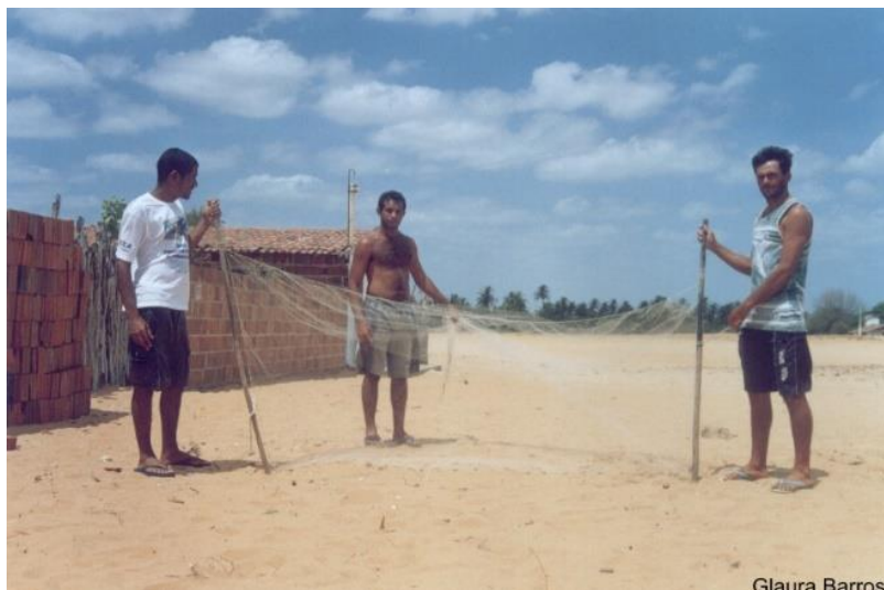
Figure 9 – Hand trawl for shrimp