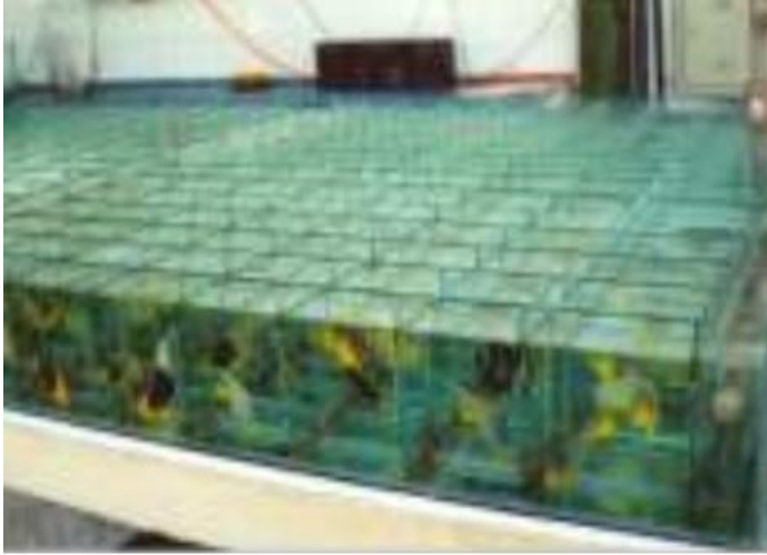
Figure 3 – Export Warehouse in Ceará