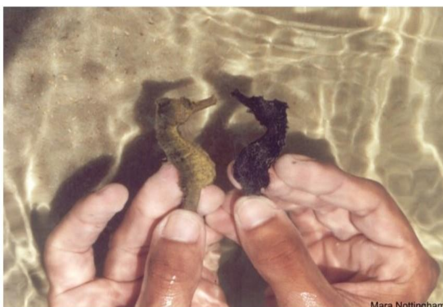
Figure 6 – Seahorse collection in shallow areas

Thirteen seahorse collectors in Ceará were interviewed, who conducted their activities in mangroves (Figures 5 and 6, Table 2), located in gamboas (sea incursions into the continent) or estuaries. Nine of these collectors had assistants, resulting in a total of thirty-two registered seahorse collectors in Ceará. The duration of their involvement in this activity varied from one to ten years, generally performed sporadically based on orders. The average number of seahorses captured per collection day ranged from five to one hundred and ten individuals, according to the interviews. Captures were made at depths ranging from five centimeters to seven and a half meters (Tables 5 and 6).