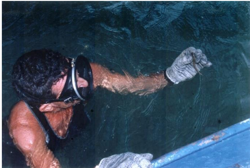
Figure 7 – Seahorse collector returning successfully from a sea dive