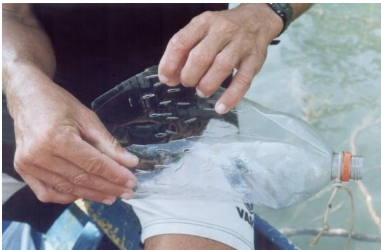
Figure 5 – Perforated PET bottle used as an alternative storage method for seahorses

Live seahorses were sold at low prices at the initial level of the marketing channel, with pricing determined by color pattern: black, yellow, and red in ascending order of value. Prices increased significantly when seahorses were sold by local retailers and were highest when sold by exporters (Table 4). Consequently, traders at higher levels of the trade channel benefited the most from the live seahorse trade, while collectors realized minimal profits.