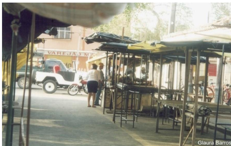
Figure 10 – Points of sale for traditional healers at the street market in Camocim

The municipalities of Barroquinha, Camocim, Jijoca, Acaraú, Itarema, Eusébio, Cascavel, and Fortim represent the primary level of the commercialization channel. Seahorses from Barroquinha are collected from the Timonha, Chapada, and Remedios rivers, marketed locally to tourists or exported to Parnaíba (PI) and Belém (PA). According to a local trader, seahorses from Belém are further exported to China. In Camocim, seahorses are inadvertently collected from shrimp fisheries in the Coreaú river estuary and sold locally in souvenir stores, grocery stores, markets (raizeiros), and sent to Fortaleza, Sobral, Rio de Janeiro, and Brasília. Dried seahorses from Jijoca are sent to the commercial center of Fortaleza. In Acaraú and Itarema, seahorses are collected from rivers and gamboas to meet local demand, with some traders from Acaraú shipping them to Maranhão. In Eusébio and Fortim, seahorses from the Pacoti and Jaguaribe river estuaries are either sent to Fortaleza or consumed locally. In Cascavel, seahorses from the Choró river estuary are sold locally or in Fortaleza. Dried seahorses from Acaraú, Eusébio, Fortim, Cascavel, and Itarema are excluded from seahorse collections for aquarium hobbies. In Aquiraz, specifically in the Iguape district, a rafter occasionally sells dried seahorses to tourists (see Table 8).