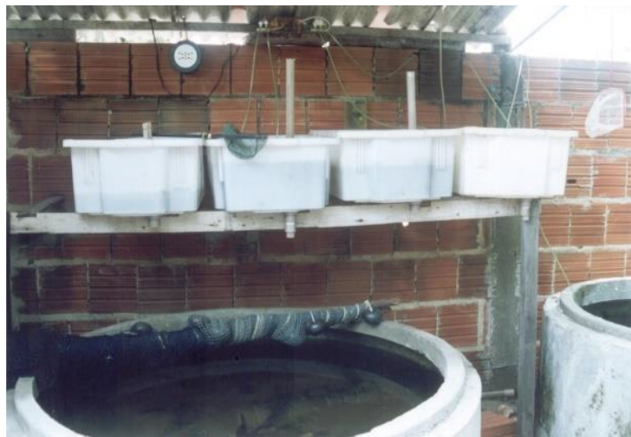
Figure 4 – Structured used for seahorse maintenance