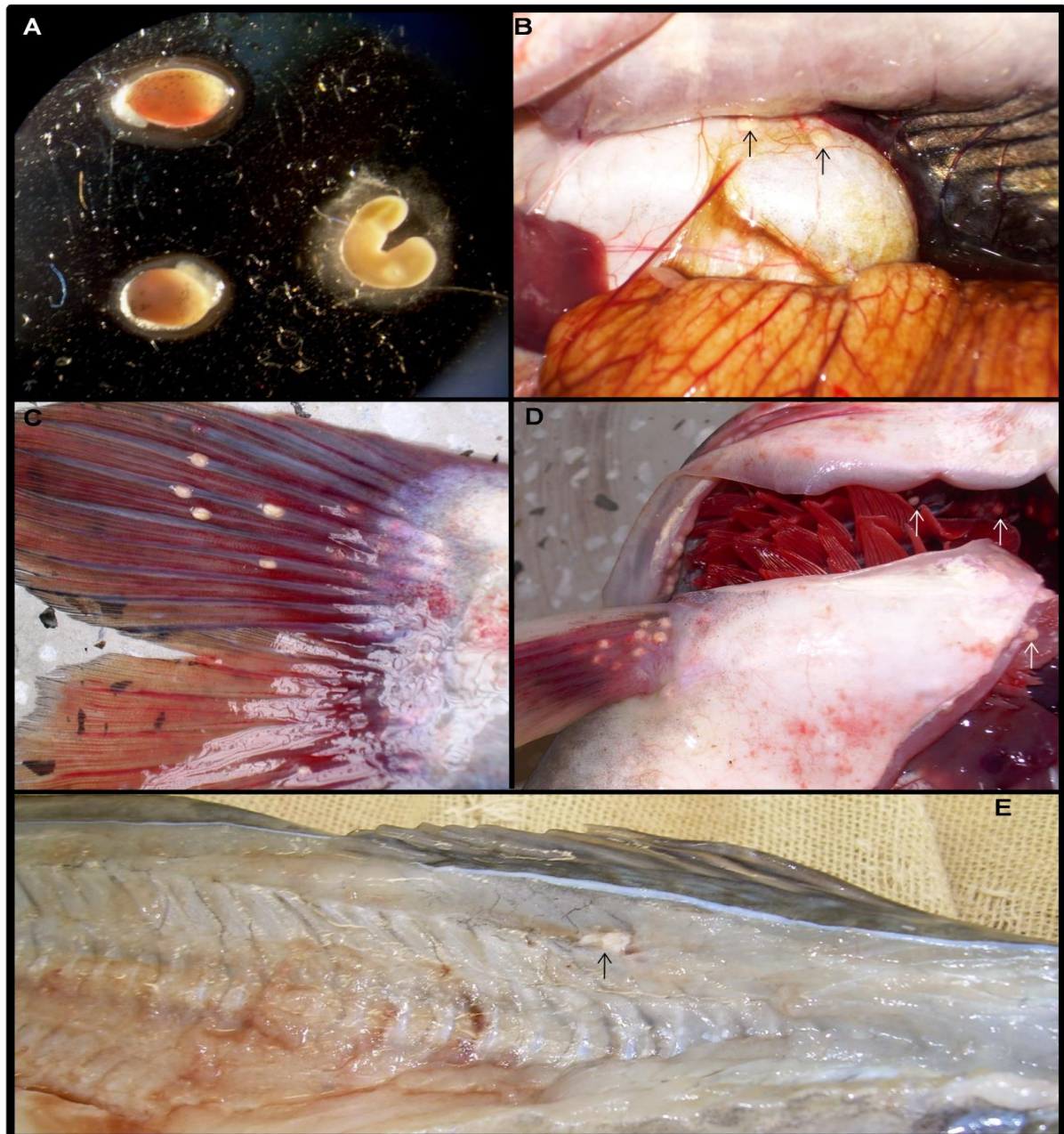
Figure 2. Metacercarial cysts of Clinostomum complanatum isolated from Rhamdia quelen (A), encysted in swim bladder (B), caudal fin (C), pectoral fin, operculum, muscle and gills (D), and ruptured cyst in muscle (E).

Oreochromis niloticus , Salminus brasiliensis , Ctenopharyngodon idella and Cyprinus carpio .