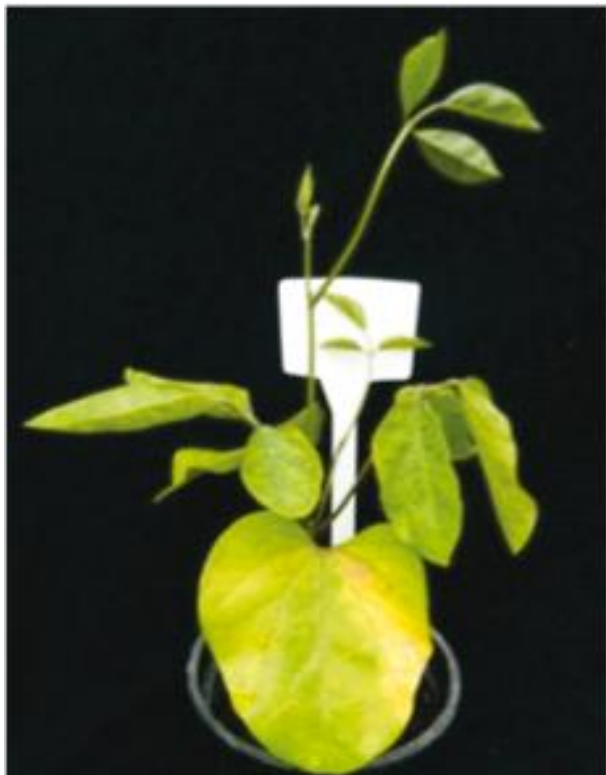
Figure 3 - Canavalia ensiformis plant inoculated with a severe strain of Cowpea aphid-borne mosaic virus (CABMV) obtained from naturally infected Passiflora edulis (CABMV-PSevere)

compared with the CABMV-PSevere replication level. Novaes and Rezende (2003) also observed the lack of cross protection between mild and severe strains of virus from the genus Potyvirus in passion fruit plants and attributed the absence of cross protection to apparent differences in the distribution of the mild virus strain and the possible low concentration of it in the infected tissues. The low concentration of mild virus strain in infected tissues will leave clusters of uninfected cells permitting the replication and establishment of the severe strain. Nevertheless, cross protection has been commonly observed between other virus strains (NOVAES; REZENDE, 2003; LIMA et al. , 2015).