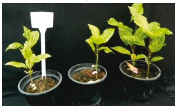
Figure 2 - Plants of Passiflora edulis inoculated with a mild strain of Cowpea aphid-borne mosaic virus (CABMV) isolated from P. edulis (CABMV-PMild) and later inoculated with a severe strain also isolated from P. edulis (CABMV-PSevere) showing severe symptoms

The interaction studies between CABMV-CFor and CABMV-PSevere also provided evidence for the absence of cross protection in C. ensiformis . Plants of C. ensiformis inoculated with CABMV-CFor and super inoculated with CABMV-PSevere 15 days later showed more severe symptoms than those shown by plants inoculated only with CABMV-CFor. Additionally, extracts from doubly inoculated C. ensiformis plants caused infections in cowpea as well as in passion fruit plants, which exhibited virus symptoms. The presence of CABMV-PSevere in inoculated C. ensiformis was also confirmed by PTA-ELISA.