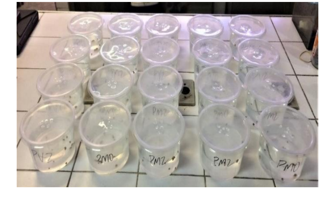
Figure 4 - Final layout of the vivaria where the animals were kept

Dissolved oxygen is the most important water quality parameter in aquaculture because its presence is essential in accessible concentrations that enable the cultivated organisms to carry out processes that are necessary for survival, such as breathing, locomotion, feeding and biosynthesis (Wang et al. , 2022). Most aquatic animals are able to thrive at dissolved oxygen levels of at least 4 mg L<sup>-1</sup> (Lima et al. , 2013).